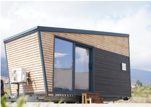
Fig.4. Mobile "Zero Energy Caravan"

The Zero Energy Caravan [10] is designed to be completely self-sufficient and not require external power sources to function. This means that the caravan uses only renewable energy sources such as solar panels, wind turbines or hydro sources to generate power for lighting, heating and cooling.