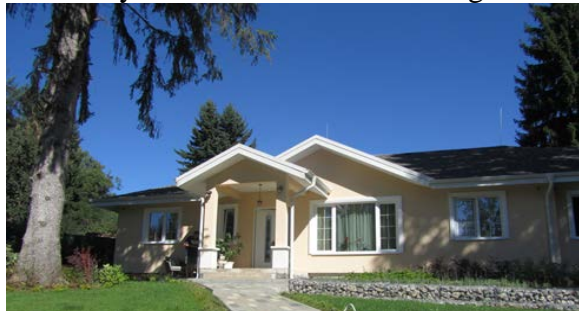
Fig.3. nZEB Family house - Bistrice, Bulgaria

This family house located in the village of Bistrice is laid out on a single storey with a total heated