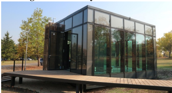
Fig. 2. InDeWaG Demonstration Pavilion, Sofia, Bulgaria

This InDeWaG Demonstrational Pavilion, is located on II campus of the Bulgarian Academy of Sciences in Sofia. It is a pioneering project demonstrating innovative Water Flow Glazing (WFG) technology. This demonstrator is part of the EU-funded InDeWaG (Industrial Development of Water Flow Glazing Systems) project, aiming to advance nearly Zero Energy Building (nZEB) standards through cutting-edge façade and interior systems (fig. 2). The building is oriented in clear geographic directions east-west, north-south. The pavilion is a glass-encased structure measuring 7.0 by 7.0 meters, with WFG