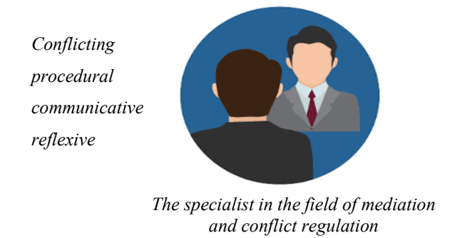
Figure 1. The competence of a specialist in mediation and conflict regulation

Defining the competencies of any specialist is the answer to a public inquiry in the preparation of these specialists. Within the project of Quality Assurance of Mediation Services through Standardization of Requirements for Basic Training of Mediators, implemented by the National Association of Mediators of Ukraine and with the participation of other public organizations that unite Ukrainian mediators, with the support of the American people provided through the United States Agency for International Development (USAID) within the framework of the New Justice Program, the standard "Basic Principles of Teaching Basic Mediator Skills. The standard regulates the competence of the future specialist in the field of mediation and conflict regulation.